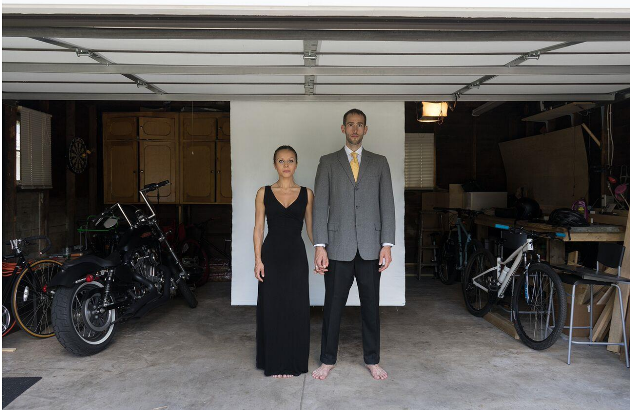
Steve Ozone, Northeast Gothic , archival pigment print, 13 x 20 inches

Form + Content Gallery presents Interrupted Landscapes , new work by Steve Ozone. Ozone's photographs combine portraits of immigrants set apart from the landscape through the use of a canvas background in both urban and rural settings. These alternative landscapes reminds us that we, excluding Native Americans, were all immigrants to the United States at one time.