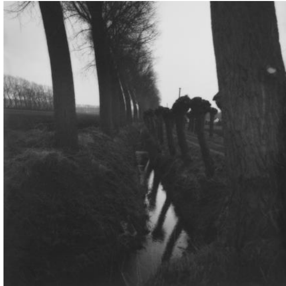
Lynn Geesaman, from the Canal series, 1995 black and white photograph, 20 x 24 inches