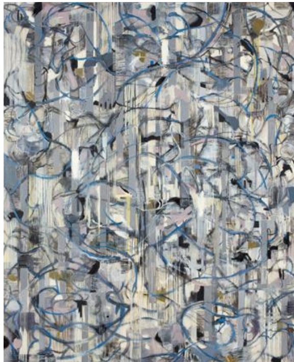
Barbara Kreft, Tempest , 2017 oil on canvas 70 x 58 inches