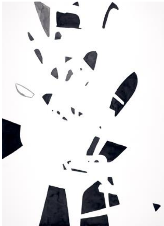
Shana Kaplow, sketch for Expansion of Influence , 2017 ink on paper (in 36 parts), 168 x 114 inches