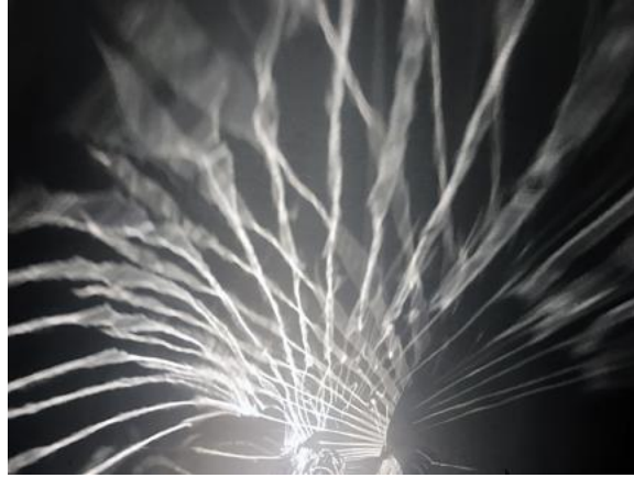
Jantje Visscher, If It's Not One Thing It's Another , 2017 7 x 35 x 5 feet, adjustable