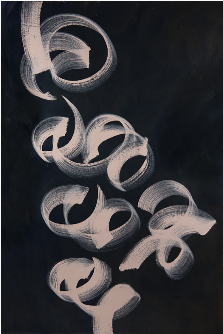
Howard Oransky, The Body in Pieces, No. 1 , oil on canvas, 68 x 48", 2020

The lightness of his brushstroke, smearing against the canvas in circular motion, summon the impulse of dancing.